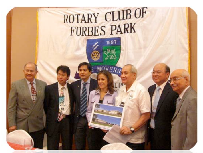
Manila (April 2010) Guam delegation meets with key members of the Filipino business community to discuss investments and Guam's expected economic potential and growth.

Regional interest in Guam continues to grow.