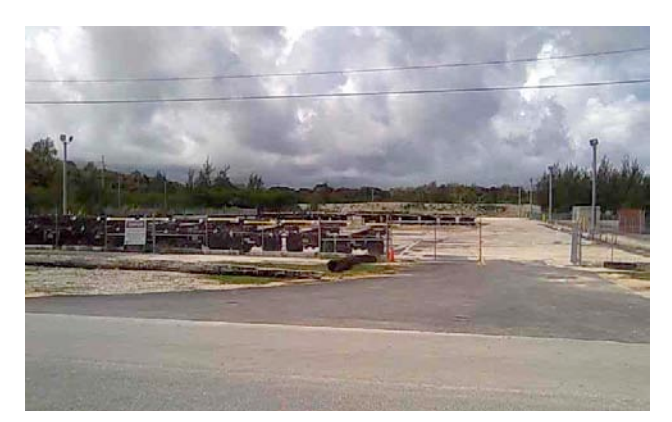
\Delta Matson development on property managed by GEDA's RPD Division

currently looking into similar management agreements with other GovGuam agencies with land inventory that could generate lease revenues at fair market value rates.